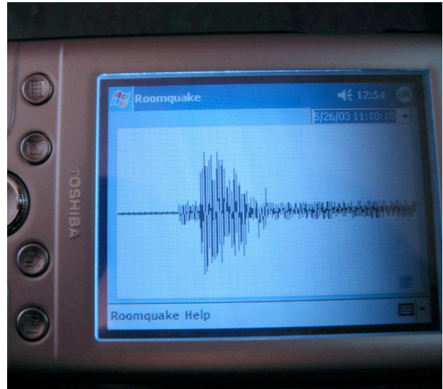
Figure 1. PocketPC serves as simulated seismograph.

Student learning was assessed in three areas: science content knowledge, knowledge of seismological practice,