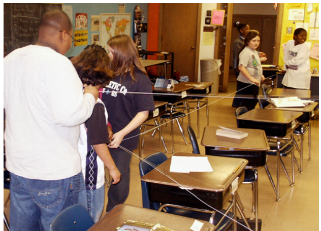
Figure 3. Sweeping arcs representing potential event loci.