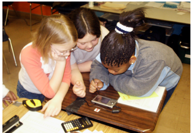
Figure 2. Determining event distance and magnitude.